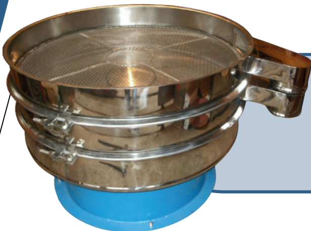
Connect part (Top View) – SS316 Non Part (Bottom) – M.S