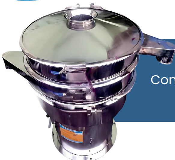
FULL BODY SS316 MATERIAL Connect part (Top View) – SS316 Non Part (Bottom) – SS316